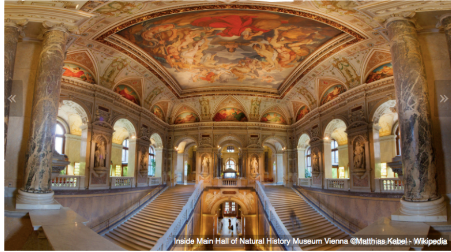
Inside Main Hall of Natural History Museum Vienna